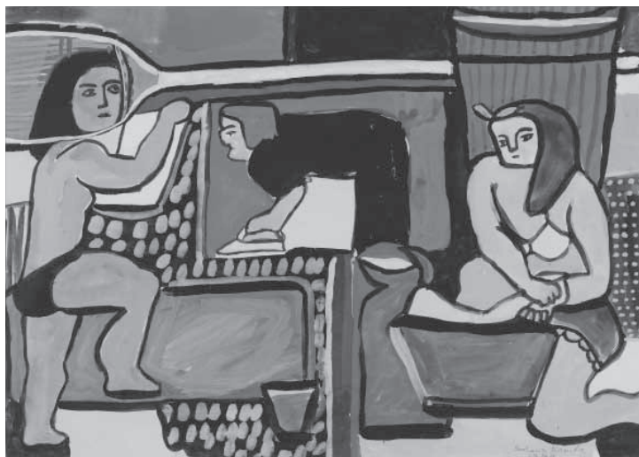
Saloua Raouda Choucair. Choucair, 1949 . Gouache on paper, 25 x 35.5 cm.

title with how , Choucair suggests that differences in the ways of seeing make direct access to the self-same object impossible: we may see how people see but not what they see. Art provokes awareness of ourselves as sighted creatures. Mindfully sighted, we must take responsibility for what we receive visually: it is a matter of neither seeing nor being, but understanding. Asking “how?” in 1951 allowed visual art more agency in the construction of modernity and modern Arabness, which brings us to the next term in her letter’s title.