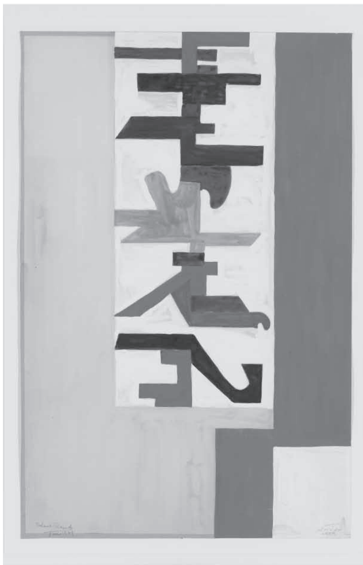
Saloua Raouda Choucair: Experiment with Calligraphy , 1949. Gouache on paper, 48 × 31 cm.

Platonic form. 36 Choucair went a step further, commanding viewers to recognize their responsibility for their particular understanding. This feat is most apparent in how she actually painted a square.